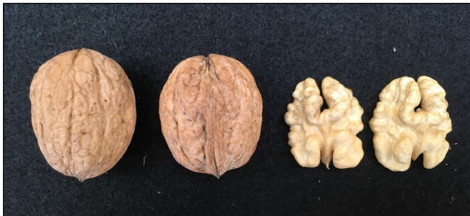
Figure 3. Nuts and kernels of 'UC Wolfskill'.

Cooperative Extension Butte County ♦ 2279-B Del Oro Avenue, Oroville, CA 95965 Office (530) 538-7201 ♦ Fax (530) 538-7140 ♦ cebutte.ucanr.edu