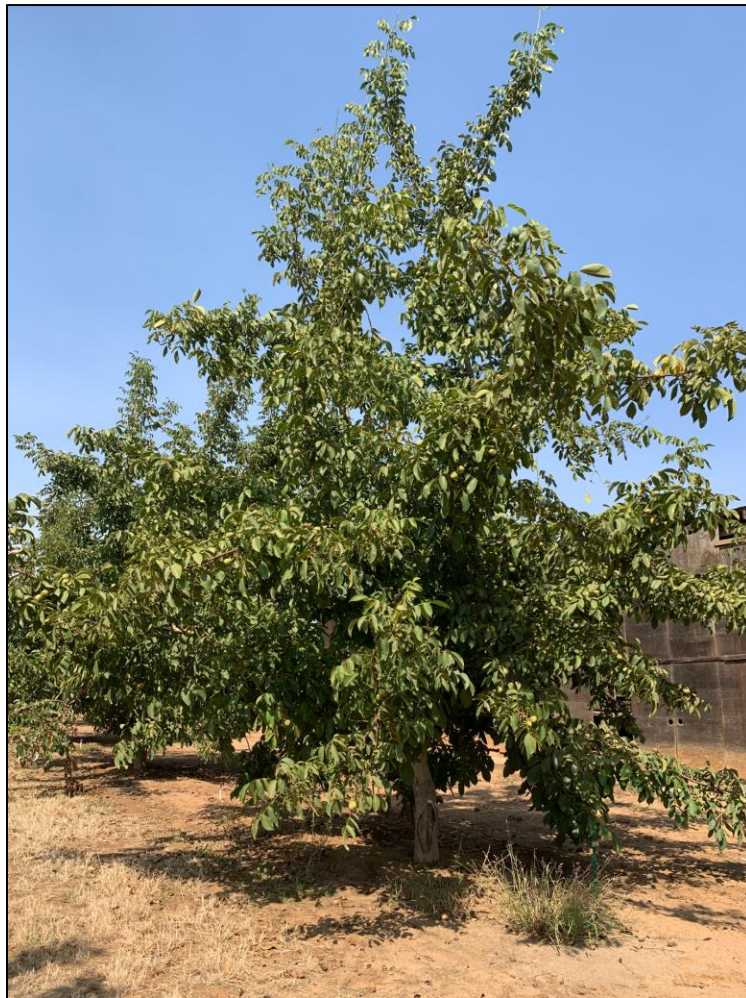
Figure 1. Unpruned, unheaded, 5 th -leaf 'UC Wolfskill' tree (photo by J. Hasey).

'UC Wolfskill' is now commercially available to California growers and can be ordered from any licensed nursery. You can learn more about the attributes of other recent releases and industry standards at: sacvalleyorchards.com/walnuts/orchard-development/cultivars .