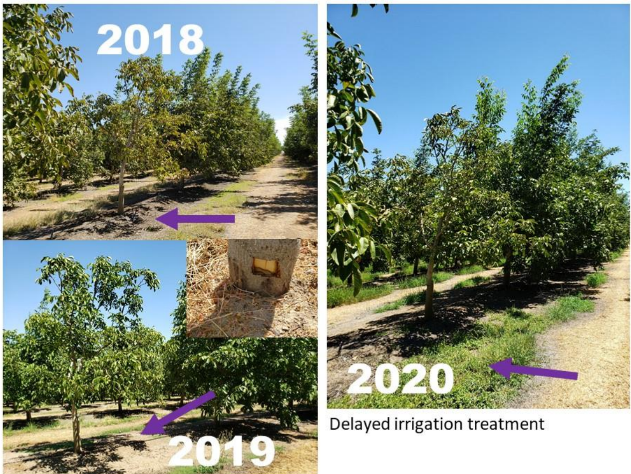
Figure 1. An ailing tree at the Stanislaus site in 2018 showed signs of deterioration. Although the trunk was somewhat sunken at the soil line and necrosis was forming under the bark (center photo), samples were collected multiple times but no Phytophthora spp. were isolated/found. This tree happened to be included in the delay irrigation treatment and during the passing of three years appears to be recovering, specifically showing greater shade under the tree canopy at midday since the beginning of the trial in 2018.

In a Stanislaus orchard consisting of Chandler on Vlach, results after three years suggest that similar benefits of delaying the first irrigation may be possible in this higher clay content soil site. Some ailing trees have shown partial recovery in the delay treatment, indicating the possibility of too much water being applied too early (figure 1). Yield at the Stanislaus site was not affected when irrigation was withheld until readings of 2 bars drier than baseline.