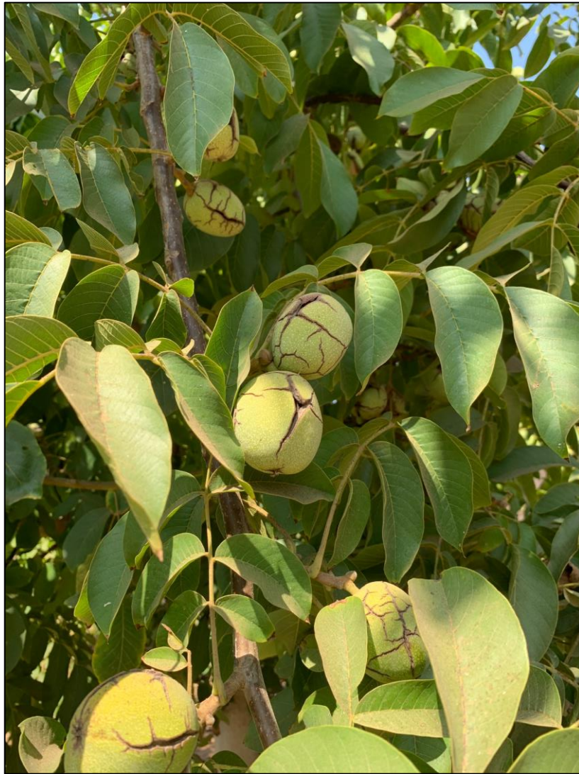
Figure 2. 'UC Wolfskill' nuts at hullsplit.