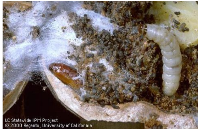
Navel orangeworm larvae, webbing, and frass in a walnut.

In short, don't take your eye off NOW in walnuts, no matter what variety you grow. Much research is still needed to determine the relative importance of a number of factors that may contribute to NOW damage (e.g., native versus immigrant populations; proximity to external sources; previous season's damage; orchard sanitation; overwintering populations; in-season codling moth, blight, and sunburn damage; degree day accumulation; populations cycles in surrounding crops; harvest timing; ethephon application; pesticide choice and application timing; and various environmental conditions). In order to answer the outstanding questions, large data sets will provide the most value. If you would like to discuss the possibility of contributing data to further the cause, please contact me at ejsymmes@ucanr.edu . All private data and site-specific identifiers will be kept anonymous.