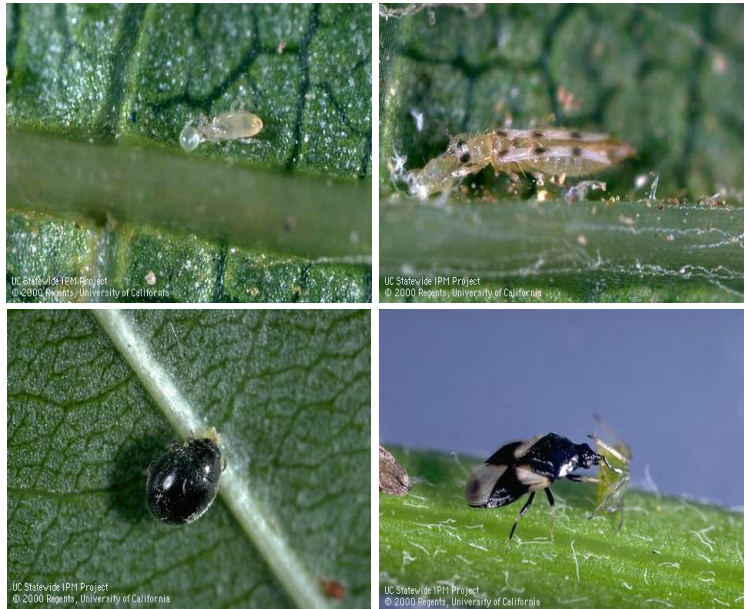
Figure 2. Spider mite natural enemies common in walnuts: western predatory mites (top left), sixspotted thrip (top right), spider mite destroyer (bottom left) and minute pirate bug (bottom right)