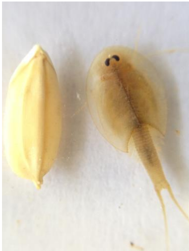
Fig. 1. Shrimp with a shell of about the size of a rice seed can injure rice. I call this the critical shrimp size.

Tadpole shrimp can be a difficult pest to manage. Most likely, the longer flood-up times we will be experiencing this year are going to make it more difficult. When flooding for seeding takes longer than normal, the shrimp have more time to grow to a size that can injure rice. Once the shrimp shell (not including the “tail”) is about the size of a rice seed (7 mm, I’ll call this the critical size, fig. 1), the shrimp can cause injury to germinating rice. Late planted fields are at more risk because of the warmer temperatures we typically see in late May; warmer weather makes the shrimp grow faster.