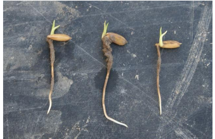
Fig. 2. Seedlings with a well developed spike and radicle are less susceptible to tadpole shrimp injury than younger seedlings. I call this the safe stage.

seedlings get established before the shrimp reach the critical size. In several trials conducted over the past few years, rice seedlings were safe from shrimp when they had a well developed spike and the radicle was well anchored in the soil (fig. 2). I’ll call this the safe stage.