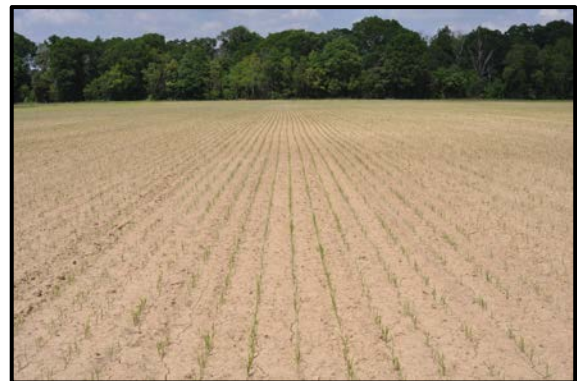
Figure 4. Drill seeded rice field before permanent flood.

flooded the water has to be drained resulting in high tailwater losses. Dry seeding can use less water if rice seed is planted to moisture which reduces the need to flush the field (or number of times field is flushed) in order to germinate the seed and establish the crop.