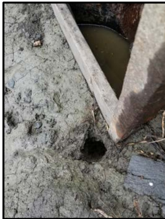
Figure 2. Leak near outlet caused by crayfish.

Fix leaks. Leaks around outlet boxes or in levees can result in significant water loss. These leaks can be caused by water erosion, crayfish, or rodents. Fields should be routinely monitored for such leaks and leaks repaired.