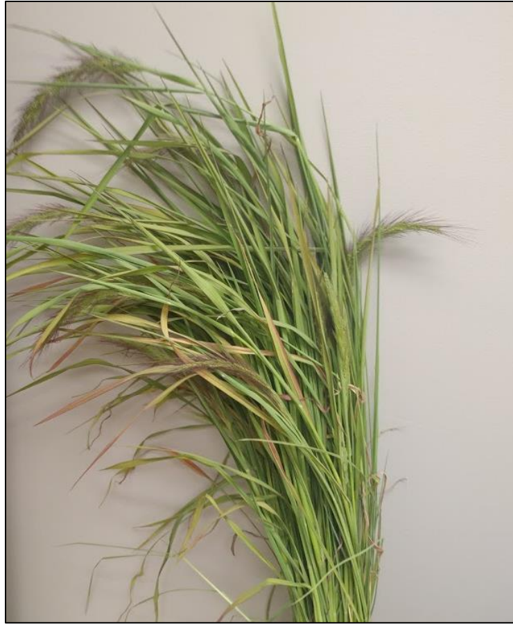
Photo 3. Full plant sample of unknown watergrass species ( Echinochloa spp.). This plant headed in late July.