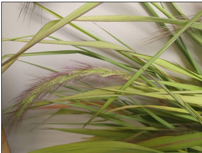
Photo 2. Seed heads of unknown watergrass species ( Echinochloa spp.) Notice visible purple awns, which can be seen before seeds are fully mature.