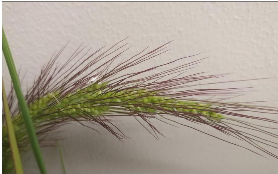
Photo 1. Seed head of unknown watergrass species ( Echinochloa spp.) Notice visible purple awns.