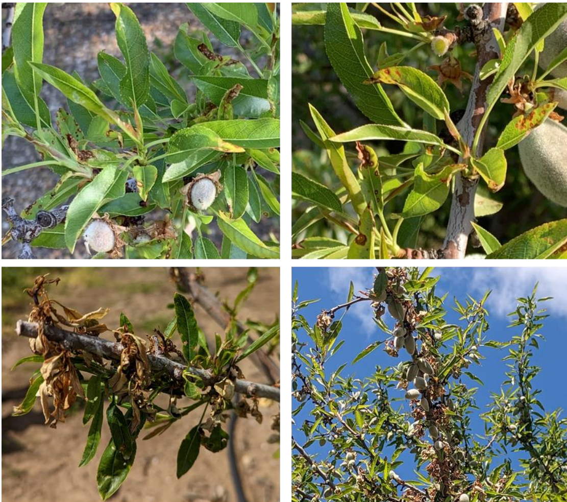
Independence on Hansen (top), Independence on Viking (bottom left), Nonpareil on Krymsk (bottom right). Spotted and misshapen leaves, dead leaf bundles, dead flowers, and aborted nuts were all common symptoms of bacterial blast this year.

With our chilly winter, many growers, managers, and PCAs were finding outbreaks of bacterial blast in their almonds this spring. Blast, which is caused by the bacterium Pseudomonas syringae , is normally seen affecting flowers and leafy spurs exposed to cold, wet weather. Blast is a challenging disease to control, given the limited number of available tools. This year, symptoms were common even in orchards which had received one or more copper dormant sprays (copper-resistant Pseudomonas populations are common throughout the state). Kasumin is also available and effective for blast control, but is expensive and can be cost prohibitive, especially if prolonged wet weather necessitates repeated applications. This leaves temperature/frost control in an orchard as your least expensive and most effective blast prevention strategy.