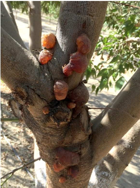
Figure 2. An almond orchard with rampant canker disease resulting from winter pruning and subsequent rainfall.

Bark protects the interior of the tree from disease infection. Pruning exposes sensitive tissue. Pruning cuts require time to heal (reform a protective layer) and during this process pathogens can infect the wood and establish a canker. As the pruning wound ages, both the risk of infection and the canker size of any infection will be reduced. The susceptibility window between pruning and subsequent rainfall ranges widely depending on the pathogen and disease crop combination. UC researchers have susceptibility windows as short as two weeks (e.g. Cytospora canker in prune trees), and as great as twelve weeks or longer (various sweet cherry canker diseases).