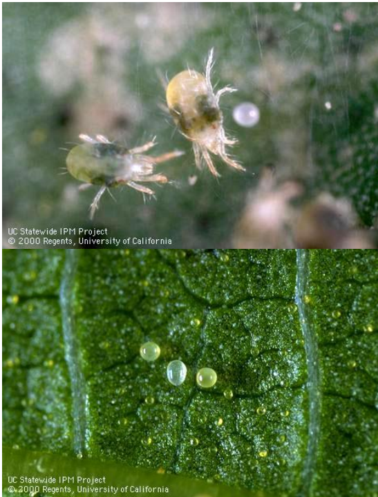
Figure 1. Spider mite adults (top) and mite eggs (bottom). The round eggs are spider mites and the oblong egg in between them is a predatory mite egg.