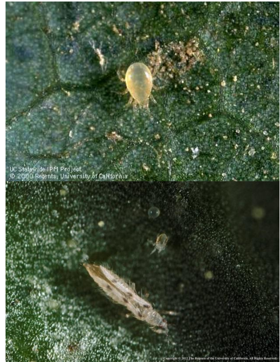
Figure 2. Predatory mite (top) and predatory six-spotted thrips (bottom).