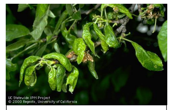
Curling and stunting of leaves caused by mealy plum aphid infestations.

Both aphid species infest growing leaves and stems in spring and summer, which can cause curling and stunting of the leaves. Serious aphid infestation can reduce tree growth, vigor, and potentially reduce fruit sugar content. Accumulation of honeydew, which these aphids excrete while feeding, results in the development of sooty mold which can potentially lead to fruit cracking.