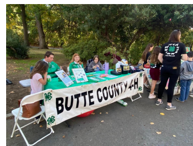
Harvest Festival at the Bidwell Mansion