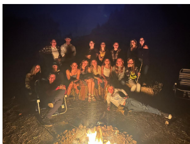
Harvest Dance & Teen Hangout Night