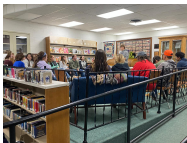
Camp Counselor Meeting at the Durham Library