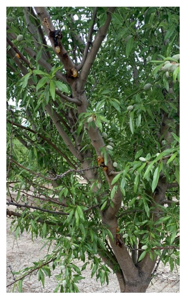
(Left, below) In some cases, blast was causing gumming at the base of infected shoots. However, the symptoms did not seem to spread into the main branch. Aldrich on Krymsk86