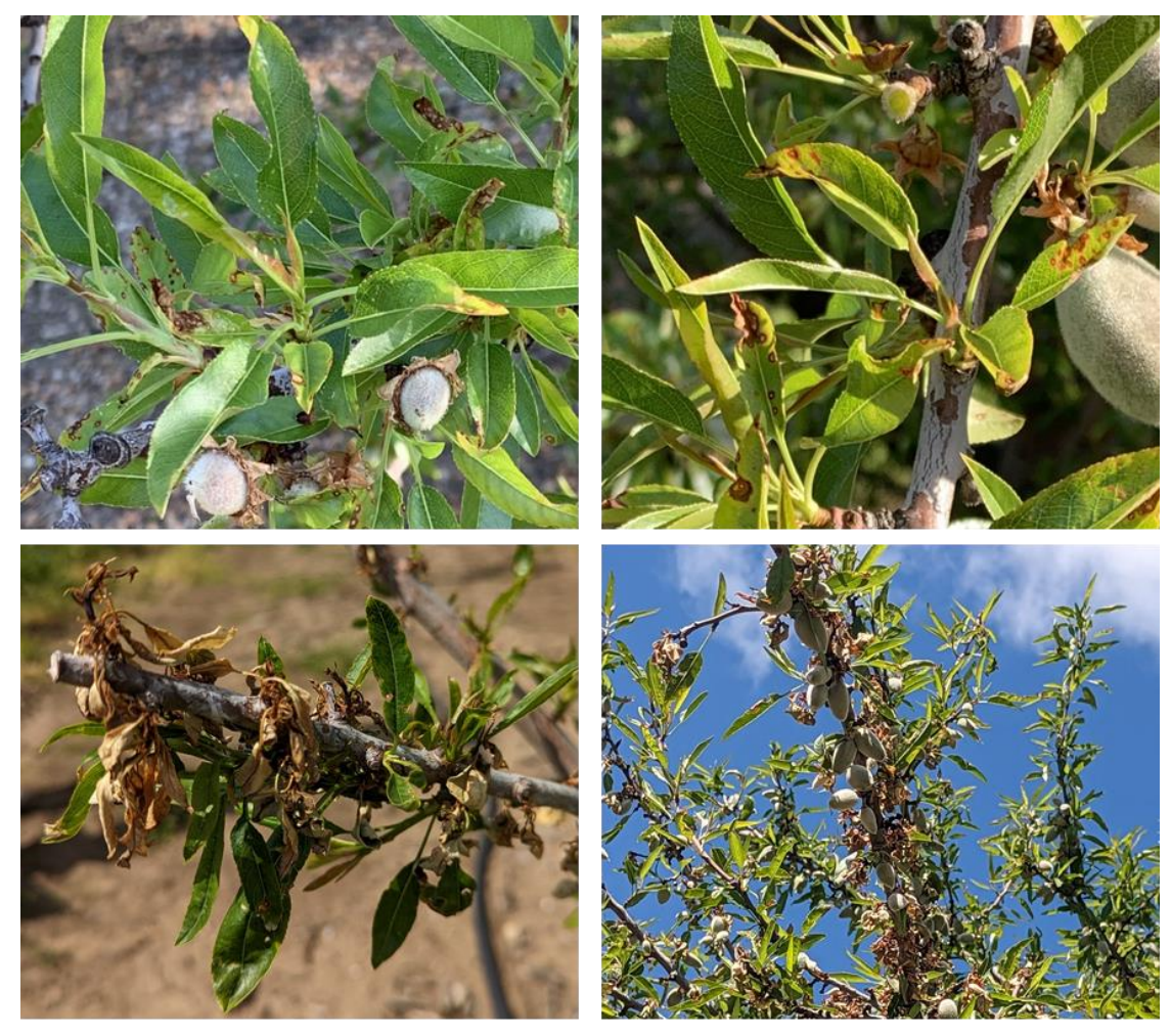
Independence on Hansen (top), Independence on Viking (bottom left), Nonpareil on Krymsk (bottom right). Spotted and misshapen leaves, dead leaf bundles, dead flowers, and aborted nuts were all common symptoms of bacterial blast this year.

With our chilly winter, many growers, managers, and PCAs were finding outbreaks of <u>bacterial blast</u> in their almonds this spring. Blast, which is <u>caused by the bacterium Pseudomonas syringae </u>, is normally seen affecting flowers and leafy spurs exposed to cold, wet weather. Blast is a challenging disease to control, given the limited number of available tools. This year, symptoms were common even in orchards which had received one or more copper dormant sprays (copper-resistant Pseudomonas populations are common throughout the state). Kasumin is also available and effective for blast control, but is expensive and can be cost prohibitive, especially if prolonged wet weather necessitates repeated applications. This leaves temperature/frost control in an orchard as your least expensive and most effective blast prevention strategy.