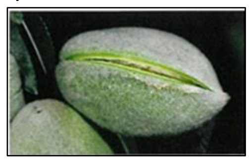
Stage 2C of hull split. This is the critical time for NOW insecticide and Rhizopus hull rot fungicide applications. The orchard is ready for harvest when all nuts are at Stage 2C.

Navel Orangeworm (NOW) & Peach Twig Borer (PTB): Continue monitoring for NOW and PTB to determine when and how to manage these pests in your orchard. Consider an edge spray when sound nuts in edge trees reach hull split Stage 2C (see photo), and a full spray once nuts in the upper canopy of trees within the orchard reach that same stage. Consult with your PCA when making decisions about NOW and PTB management. Switch insecticide chemistries between generations. See the article in this newsletter for more information on NOW hullsplit sprays.