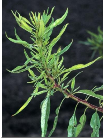
Fig. 1. Zinc deficiency.

Zinc (Zn) is part of the enzyme system that regulates terminal growth and plant cell expansion. Trees with severe deficiency may experience dormant flower bud drop and decreased fruit set, will have shortened internodes and small 'little leaf' symptoms, and have chlorotic leaves with wavy margins (Fig. 1). With mild deficiency, leaves may be slightly smaller than normal with areas of interveinal chlorosis. Young trees can be deficient without showing any visual symptoms so it is important to get a July tissue analysis even in young orchards. Zinc is deficient if a July leaf analysis is below 15 ppm.