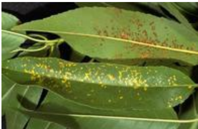
Figure 2. Almond leaf rust.

In orchards with a history of rust, treatments should be applied before symptoms appear: 5 weeks after petal fall and a second application 4 to 5 weeks later to control leaf infections. Monitoring can be done in April through May. Surveys by orchard block where 1% leaf infection occurs are at high risk if conducive environments persist. Two or three applications may be needed in orchards that have had severe rust problems.