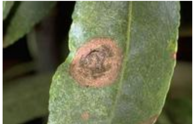
Figure 1. Alternaria leaf spot.

Disease resistance against QoIs (strobilurins – FRAC group 11) and SDHIs (FRAC group 7) occurs in the Sacramento Valley. Late-spring/early-summer applications should alternate materials to manage resistance. New materials (Quash, Inspire Super - both containing FRAC group 3) and Ph-D (FRAC group 19) must be used in rotations and mixtures for resistance management. Newer SDHI fungicides (different sub-groups) such as Luna Sensation, Luna Experience, and Merivon (Fontelis should always be mixed with a DMI fungicide) are proving to be highly effective but the potential for resistance is also extremely high. Combination tank mixtures, pre-mixtures, and rotations will be required for preventing disease resistance to the newer SDHI compounds.