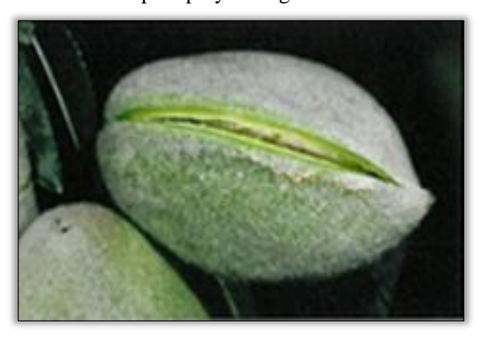
Stage 2C of hull split. This is the critical time for NOW insecticide and Rhizopus hull rot fungicide applications. The orchard is ready for harvest when all nuts are at Stage 2C.

Navel Orangeworm (NOW) & Peach Twig Borer (PTB): Continue monitoring for NOW and PTB to determine when and how to manage these pests in your orchard. Given the high levels of NOW damage we saw last year, and the challenge many growers had in sanitizing orchards over the winter, this is a year to pay special attention to your NOW management. Consider an edge spray when the first sound nuts in the upper canopy of border trees reach hull split Stage 2C (see photo), and a full spray once nuts in the upper canopy of trees within the orchard reach that same stage. Consult with your PCA when making decisions about NOW and PTB management. Switch insecticide chemistries between generations. See the article in this newsletter for more information on hull split spray timing.